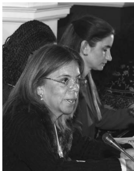
Congresswoman Olga Ferreira de López of Paraguay and former member of Congress Anel Townsend of Peru

created in other parts of the state, including parliamentary commissions and ombudspersons for women’s rights. Likewise, recognition of the importance of better policy coordination is leading to the creation of inter-sectoral committees at more senior levels of administration. Perhaps the most encouraging trend is the growing production of gender indicators and the practice of keeping gender-disaggregated statistics. In Chile, for example, Sernam has entered into agreements with the National Statistics Institute to produce more information that contains statistics that are disaggregated by gender. Developments such as these are important because this kind of information can be a powerful tool for women’s movements, female legislators, and WPAs to raise public awareness about the situation of women and the reality of gender-based discrimination. To the extent that gender-sensitive budgeting also expands in the region, it will become increasingly difficult for political leaders to make rhetorical commitments to women’s rights policies while not increasing budgetary outlays. It’s important to note that many of the improvements that have occurred owe to successful mobilization by women’s movements, often in alliance with legislators and “femocrats” in WPAs. Hence, women’s movements need to keep up their pressure on governments. Female legislators and WPAs, in turn, should encourage the formation of strategic alliances with women’s organizations.