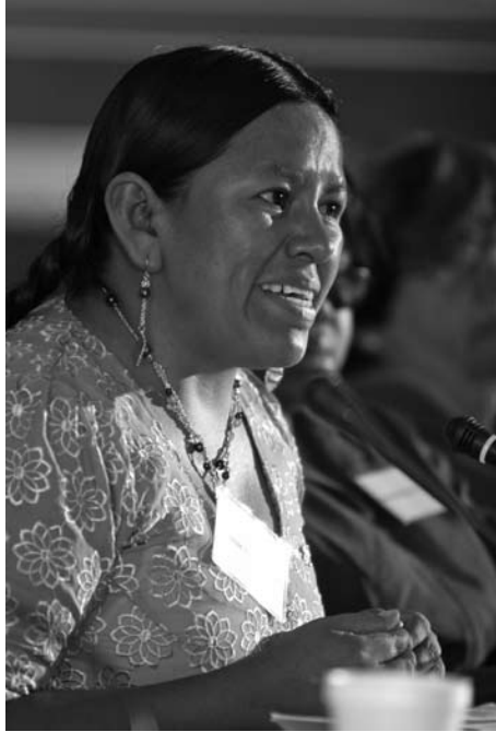
Congresswoman Nemecia Achacollo Tola of Bolivia

society and the state. This function can be critical. For example, greater support for legislative initiatives to improve Chile's domestic violence legislation followed from the dissemination of studies carried out by Chile's National Women's Service (Sernam) about the extent of domestic violence in the country. Of course, carrying out this function requires a prior capacity to gather data (both through quantitative and qualitative studies about women's social, economic, and political roles), along with a capacity to disseminate findings widely, not just via the media, but also through public awareness campaigns that educate society about the seriousness of problems such as domestic violence and sexual harassment in the workplace (see Rai 2003).