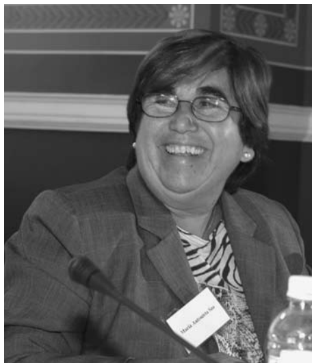
Congresswoman María Antonieta Saa of Chile

These are just a few recommendations for continuing the progress that women have made in the past six years. Women's groups, political parties, and governments need to continue to promote women's equality and develop more effective ways to increase women's access to the political arena. The path to political equality is long, and while women in the Americas have made significant progress, this must be tempered with recognition of the work still ahead.