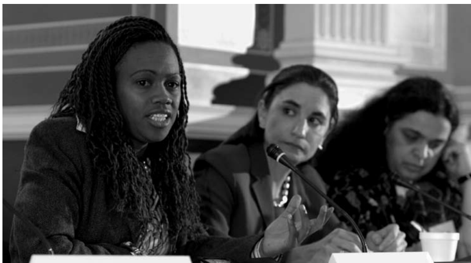
President of Costa Rica's PAC party Epsy Campbell Barr, former member of Congress Anel Townsend of Peru, and PRI president Beatriz Paredes of Mexico

Afro-descendant women are discovering that one way to break Latin America's self-perpetuating cycle of exclusion is to pursue political office. As public officials they can be increasingly visible and serve as