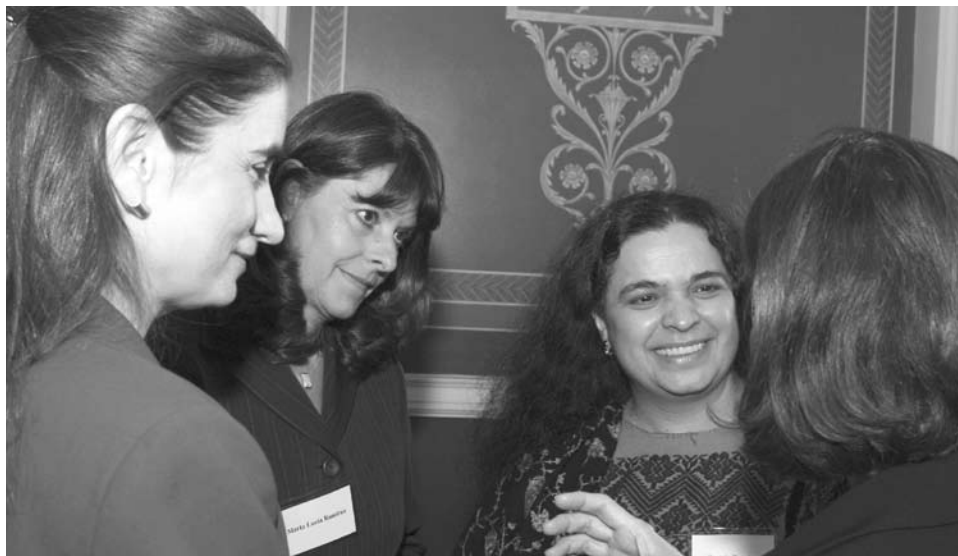
Former member of Congress Anel Townsend of Peru, Senator Marta Lucía Ramírez of Colombia, and PRI president Beatriz Paredes of Mexico

2. End the exclusion of Afro-descendant and indigenous women through affirmative action, quotas, and financing. Quota laws alone cannot erase all types of discrimination. Participants were quick to point out that Afro-descendant, indigenous, and poor women often continue to be excluded, even