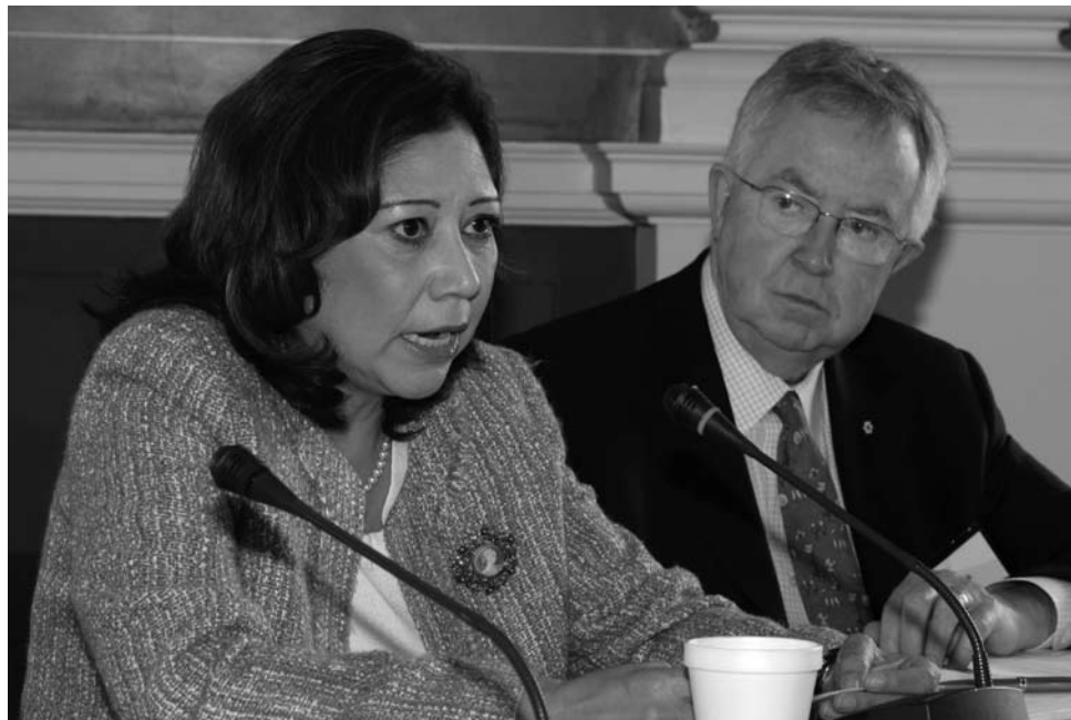
Rep. Hilda Solis (D-CA) and former Prime Minister Joe Clark of Canada